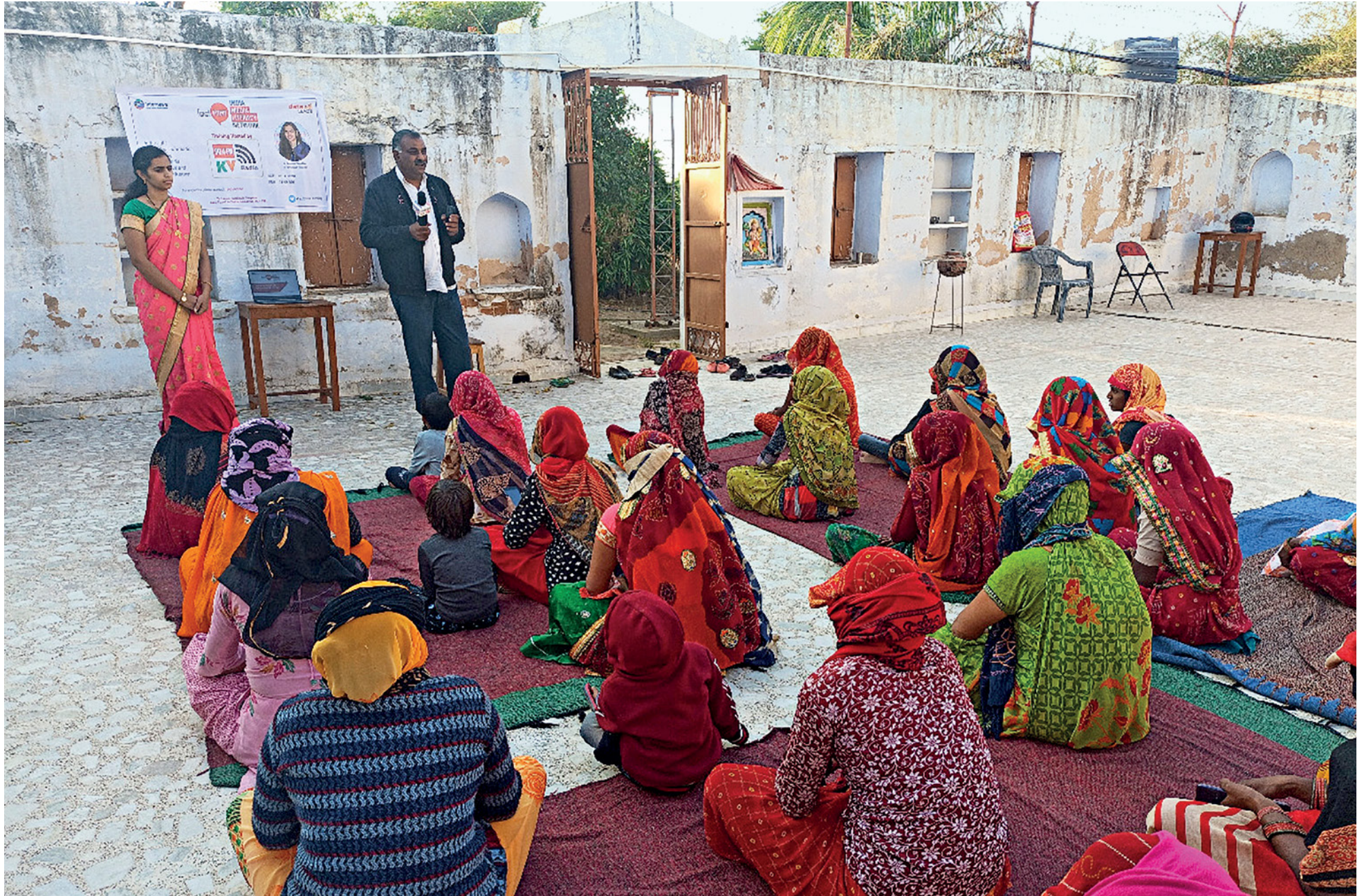
Kamalvani community radio with farm workers, home makers and cattle rearers in village Jhunjhunu, Rajasthan