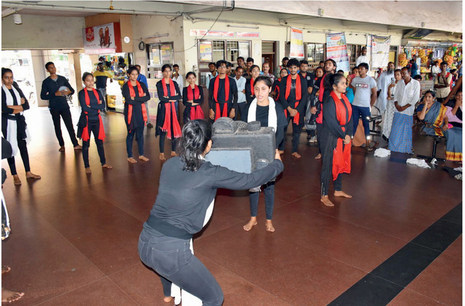
Radio Sarang with 'Journey Theatre Group' executing a street play on the FactShala curriculum for 'Information Literacy' & 'Fact-Checking' at St Aloysius College in Mangalore, Karnataka