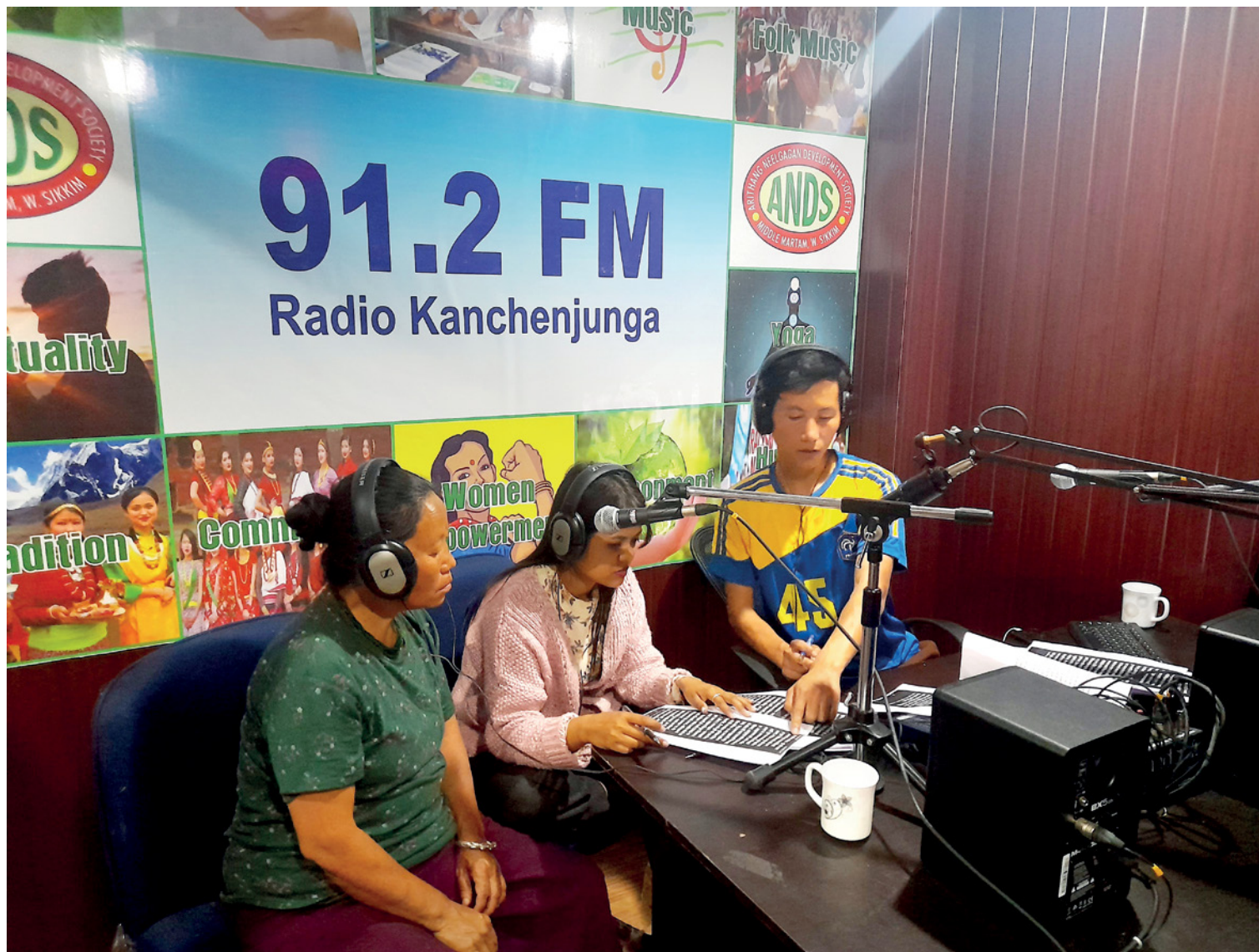
Radio Kanchenjunga broadcasting information literacy bulletin in Sikkim