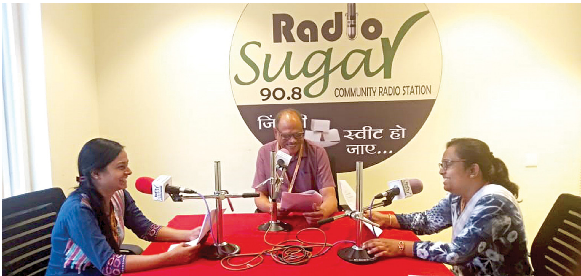
Radio Sugar broadcasting training for the Marathi listeners of Islampur, Maharashtra