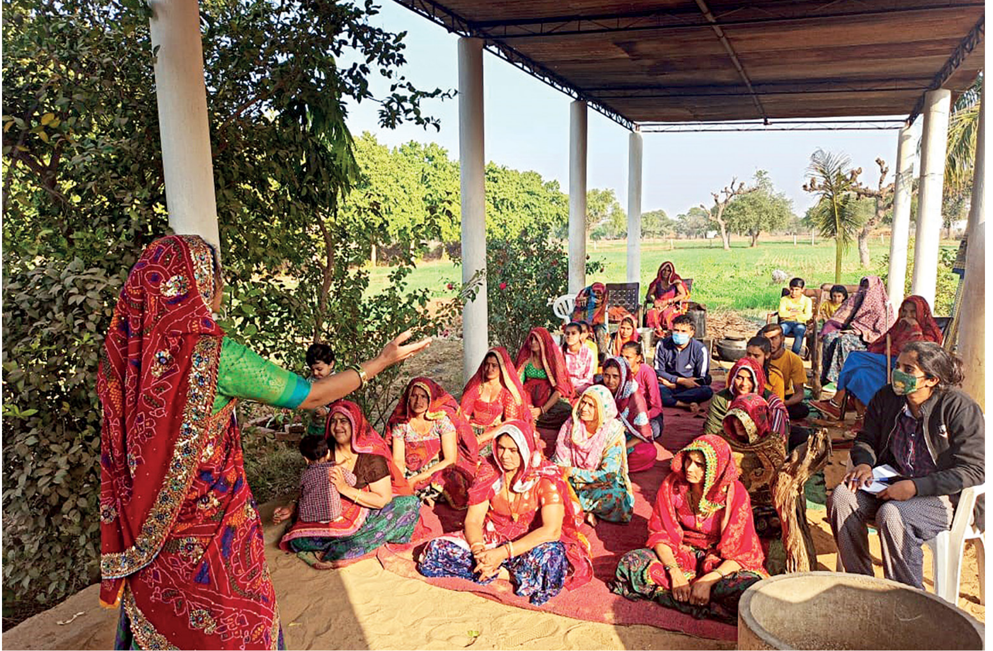
Kamalvani community radio with women in village Jhunjhunu, Rajasthan