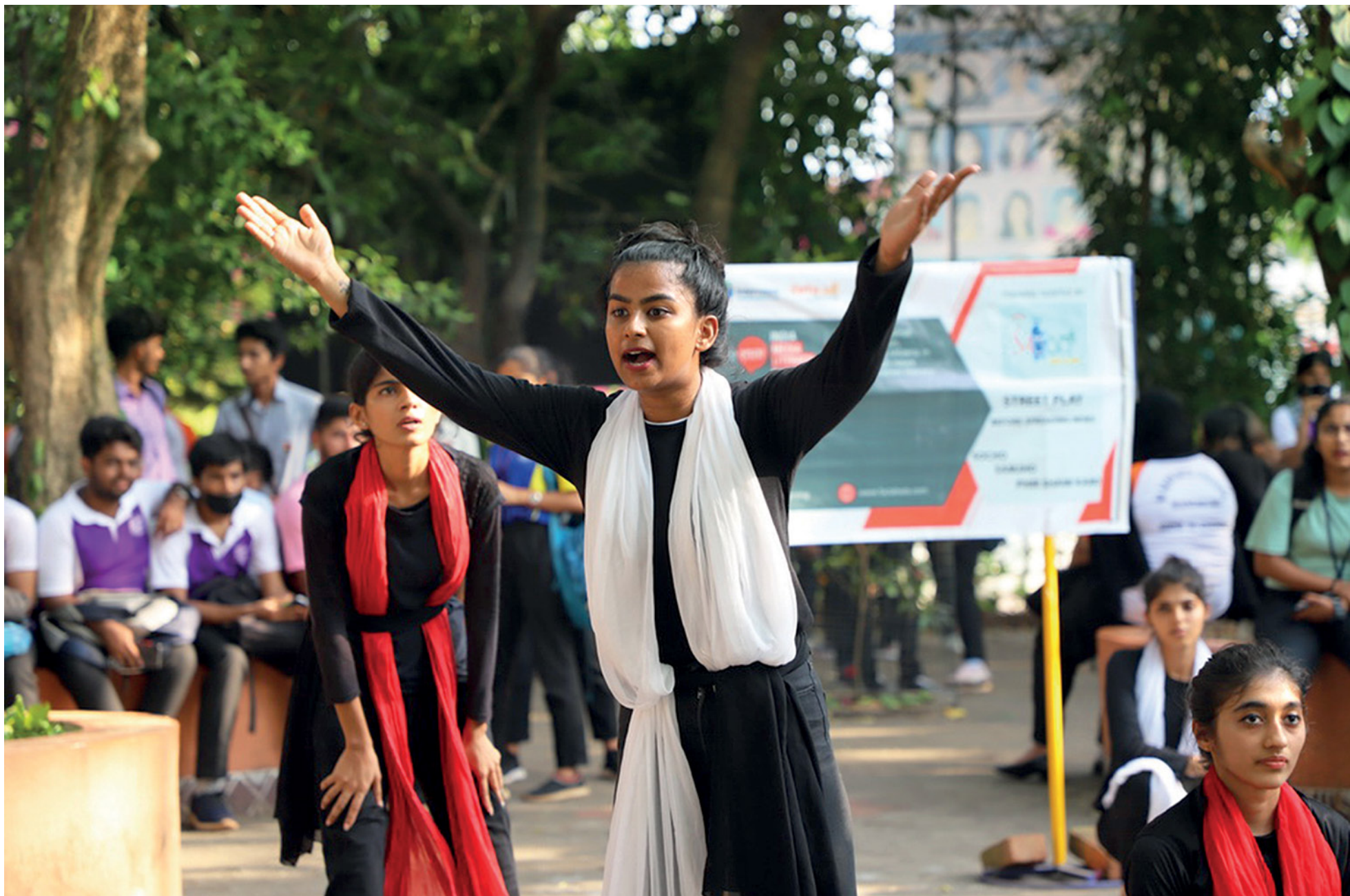
Radio Sarang performing a street play along with 'Journey Theater Group' at KSRTC a bus stand in Mangalore, Karnataka