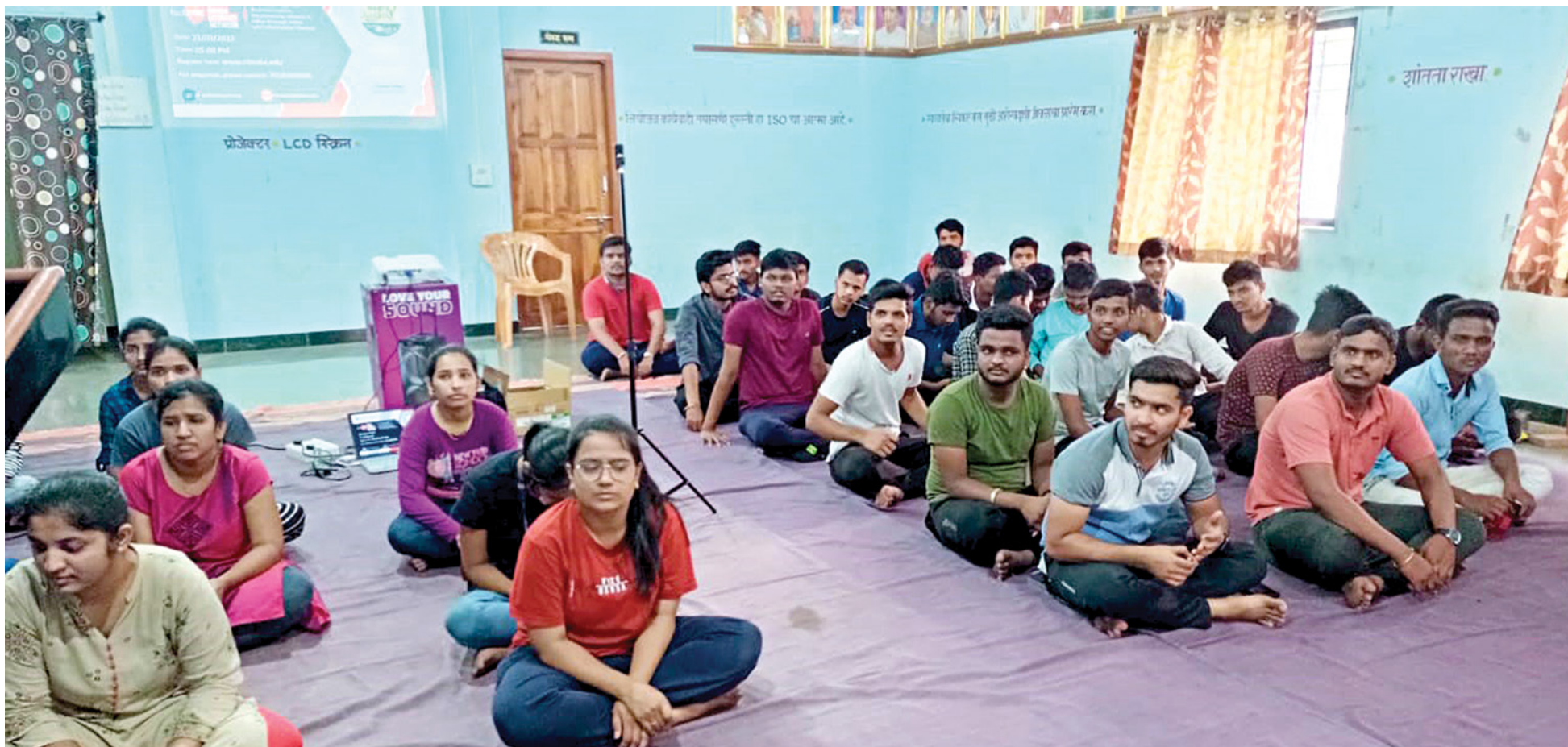
Radio Sugar at Shivaji University Kolhapur, Maharashtra