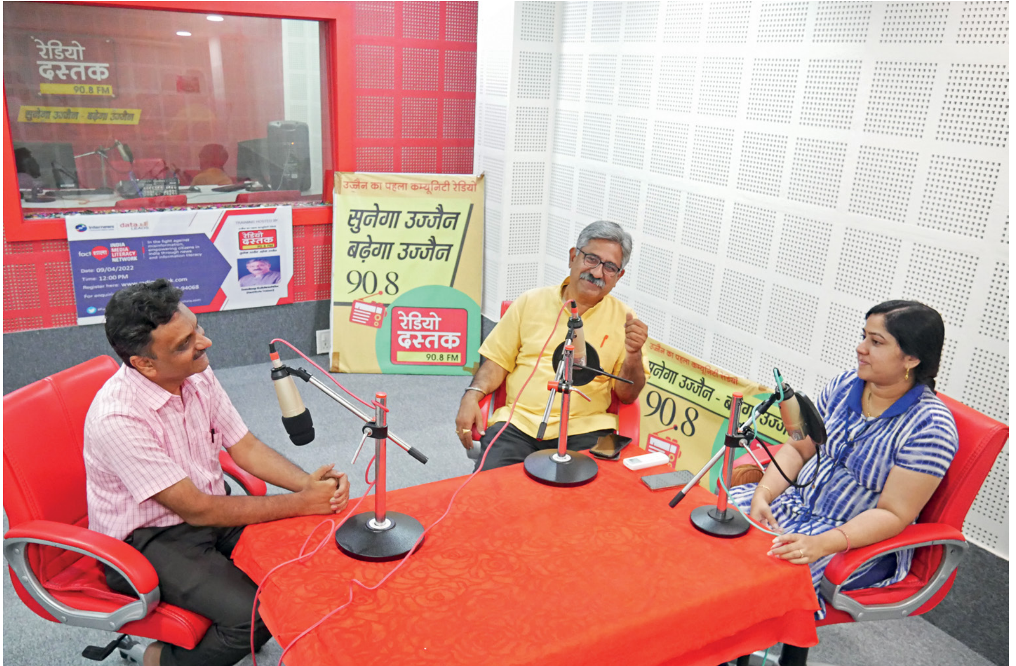
Radio Dastak 90.8 FM broadcasting FactShala bulletin for their Hindi audience on the topic 'Misinformation, Disinformation, Fake News' at their studio in Ujjain, Madhya Pradesh