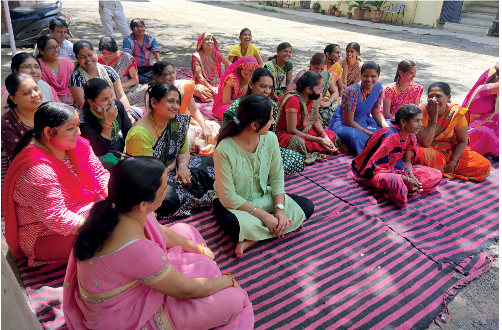
Radio Dastak 90.8 FM with locals at Village Chintaman Jawasiya in Madhya Pradesh