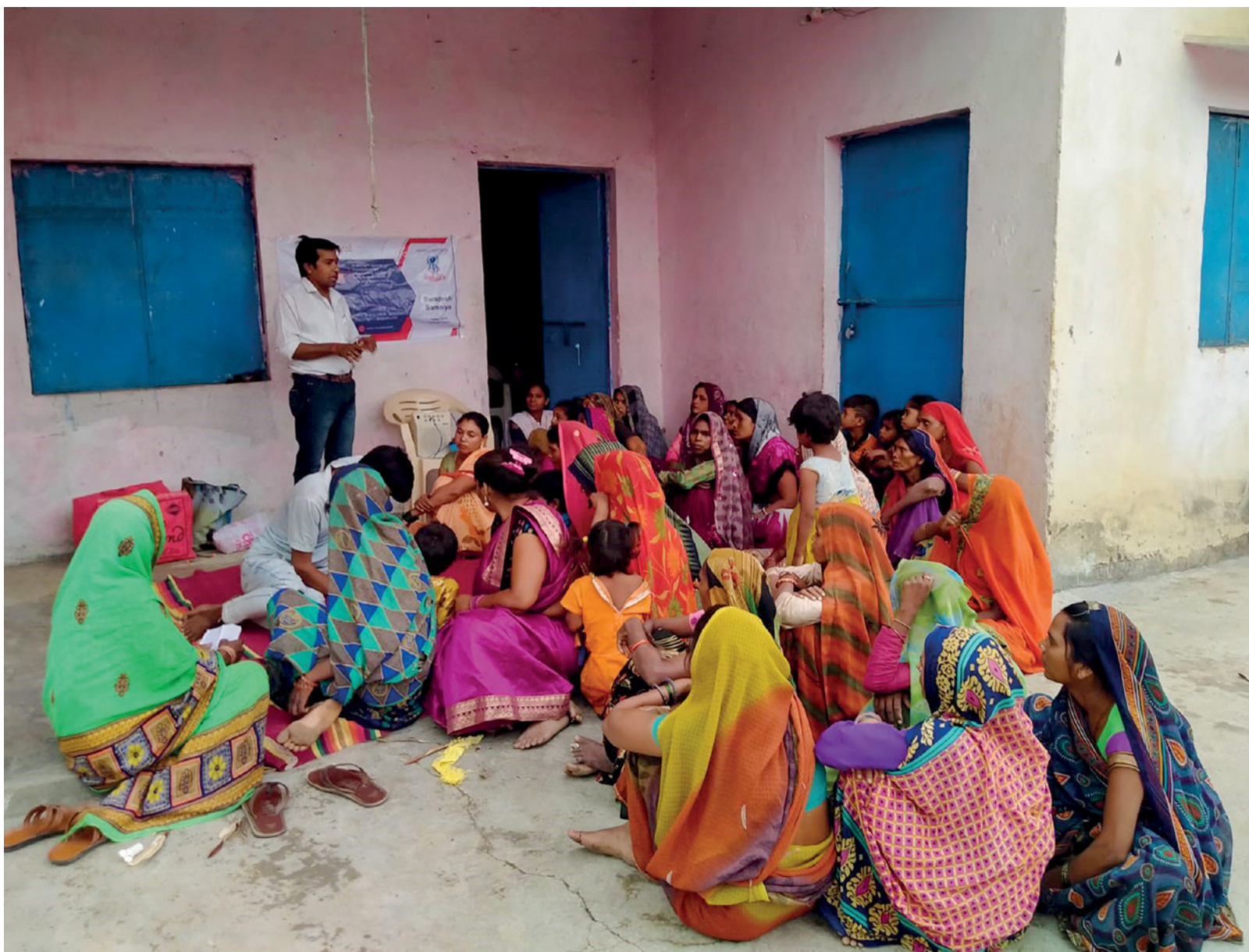
Chanderi Ki Awaaz, a community radio station training local villagers in collaboration with Swadesh Samaiya, SHG Group in Gram Tagari, Madhya Pradesh